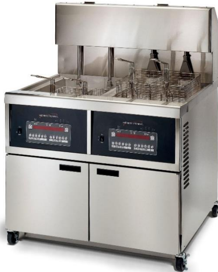
OGA 342 2-well large capacity auto lift gas open fryer

Henny Penny open fryers offer high-volume frying with programmable operation, oil management functions and fast, easy filtration.