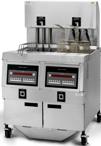
OGA 322 2-well gas auto lift open fryer

OGA 321 1-well gas OGA 322 2-well gas OGA 323 3-well gas