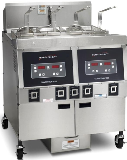
OFE 322 2-well electric open fryer with split vats and Computron™ 1000 control

OFE 321 1-well electric OFE 322 2-well electric OFE 323 3-well electric