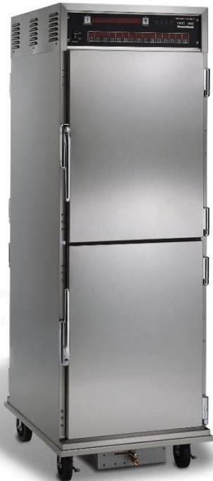
HHC 990 SmartHold full-size heated holding cabinet with automatic humidity control

Henny Penny SmartHold humidified holding cabinets create and maintain ideal conditions for holding a wide variety of hot foods over extended periods of time prior to serving.