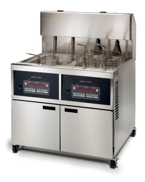
OGA 342 2-well large capacity auto lift gas open fryer

Henny Penny open fryers offer high-volume frying with programmable operation, oil management functions and fast, easy filtration.