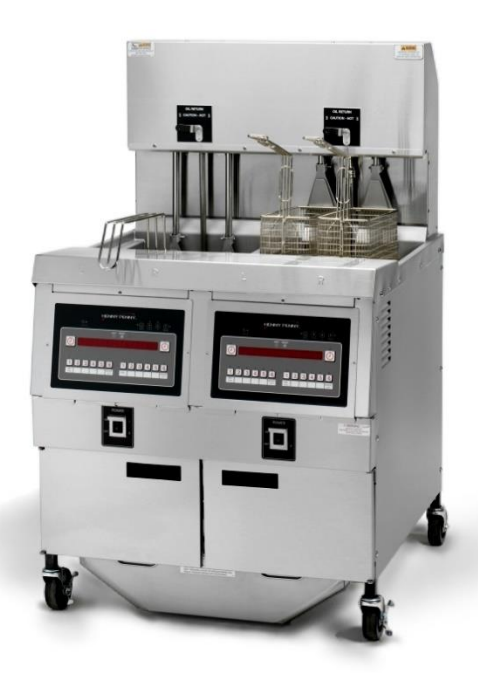
OGA 322 2-well gas auto lift open fryer

Henny Penny open fryers offer high-volume, integral multi-well frying with programmable operation, oil management functions and fast, easy filtration.