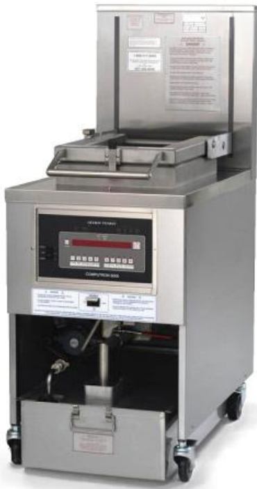
OFE 291 high volume electric open fryer

Henny Penny high volume open fryers offer tremendous throughput in a highly reliable frying platform with programmable operation, oil functions and fast, easy filtration.