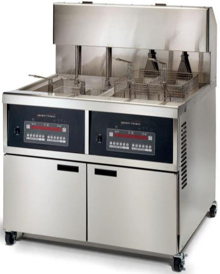
OEA 342 2-well large capacity auto lift electric open fryer

OEA 341 1-well electric OEA 342 2-well electric