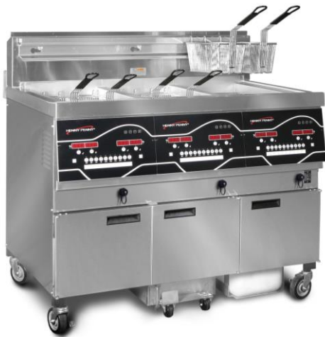
EEG 243 3-well gas open fryer