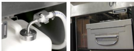
Oil replenished automatically from JIB for multi-well (left) or reservoir for 1-well (right)

Henny Penny Evolution Elite® open fryers use innovative filtering and oil level technology to extend oil life, improve product quality and reduce overall oil consumption and costs. Here's how: