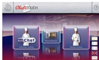
Chef'sTouch control: Just tap and swipe to run automated cooking and operating apps

Henny Penny FlexFusion combi ovens combine different cooking methods into one piece of equipment with the flexibility to cook nearly everything on your menu to perfection.