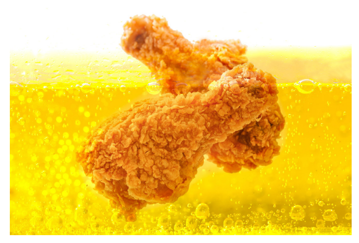
Prime Filter powder added to vat for daily polishing filter keeps your oil looking good and your fried food tasting its best.

hennypenny.com 800 417 8417 800 417-8405 24-hour support